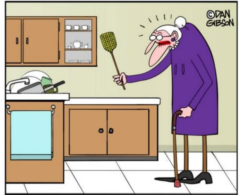
The moment Tillie realized that the fly she's been chasing around the kitchen for the last half hour is actually just an eye floater.