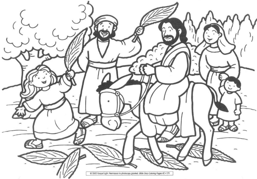
Jesus enters Jerusalem. Matthew 21:1-11; Luke 19:29-44; John 12:12-19