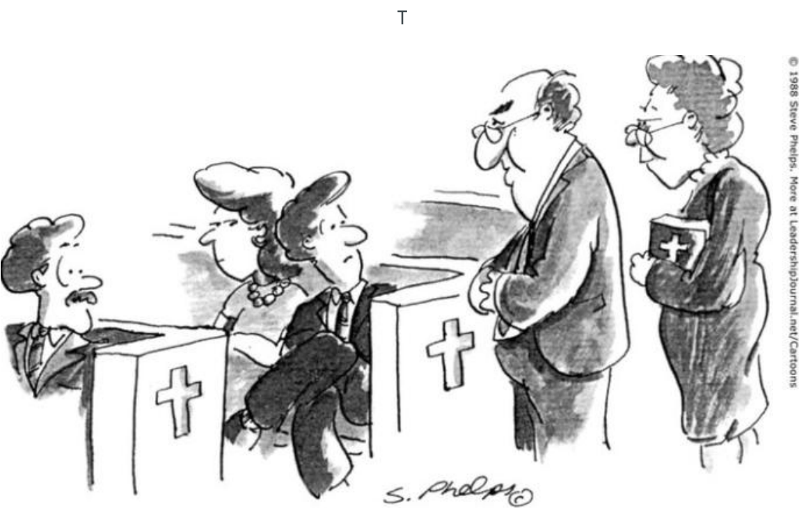
The whole church watched with nervous anticipation as the visitors sat where the Martins have sat for 42 years.